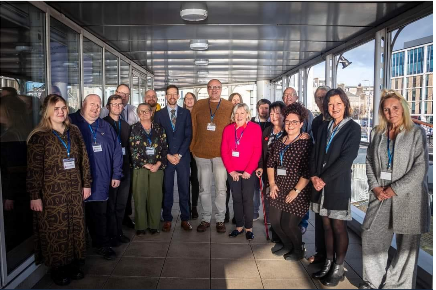
The Dundee Fairness Leadership Panel.